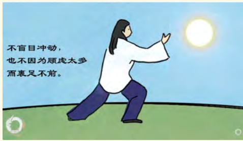
禅学第三集：禅学背后的“心法”