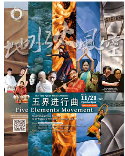
TVQS created & organized Five Elements Movement performance at the invitation of Renci@Woodlands nursing home. We presented on 21 Nov 2025 2pm to about 150 audience, ranging from staff & patients to foreign workers.