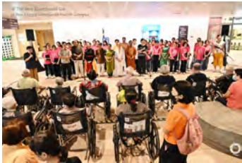
Video extract of Five Elements Movement at WHC"