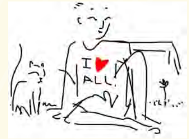
禅学 第一集：禅学是心灵卫生的泉源